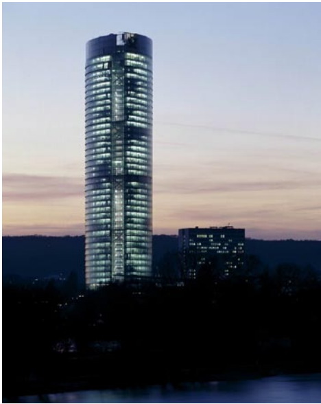
Figure 2. Post Tower/Bonn