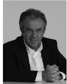
Werner Sobek mail@wernersobek.com

Werner Sobek Ingenieure, Albstr. 14, 70597 Stuttgart/Germany, Email: mail@wernersobek.com