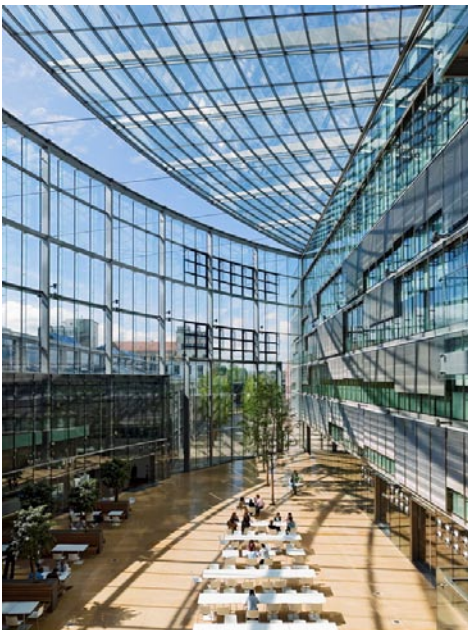
Figure 3. Merck Serono Headquarter/Geneva

Sustainable design requires a holistic approach, where the specialist consultants from various disciplines are included from the very beginning of a project. These specialist consultants have to be able to understand the needs and intentions of the other disciplines. This process is herein after called integrated design.