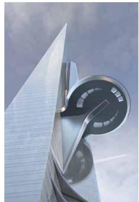
Figure 3. Kingdom Tower, Jeddah

We would certainly have to have a good look at what is going on with the building boom around that time and where we are seeing a significant amount of construction. ■