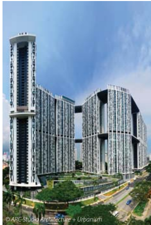
Best Tall Building Asia & Australasia Pinnacle @ Duxton, Singapore ARC Studio Architecture + Urbanism