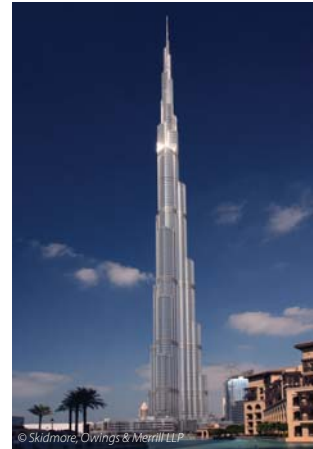
Best Tall Building Middle East & Africa Burj Khalifa, Dubai Skidmore, Owings & Merrill LLP