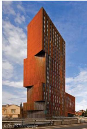
Best Tall Building Europe Broadcasting Place, Leeds Feilden Clegg Bradley Studios