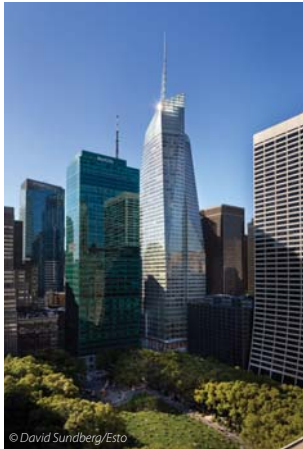
Best Tall Building Americas Bank of America Tower, New York Cook + Fox Architects LLP