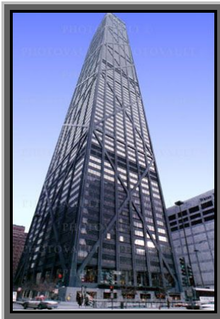
John Hancock Center