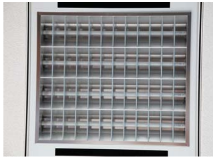
Taipei 101's Energy Saving Light Tubes

Lin: When we started this program our goal was to obtain LEED Gold certification, but now we decided to try to obtain a LEED Platinum certificate. We chose to further reduce energy consumption to provide a good indoor environment for our tenants and to get recognition through LEED certification. Hopefully this will encourage other buildings to make the same commitment to contribute to the improvement of global warming. Also, we learned that only 24 buildings in the United States have received LEED-EBOM platinum rating and these are all relatively smaller buildings, with only two of them containing over 700,000 square feet (65,000 square meters). TAIPEI 101 offers more than 2,000,000 square feet (185,800 square meters), so we consider it a challenge to rise above them all. Obtaining LEED Platinum would require an additional US$1,500,000 investment.