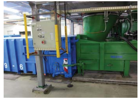
Taipei 101's Grabage Disposal System

The Empire State Building and Taipei 101 prove that green retrofitting of tall buildings requires a team effort for the smart implementation of practical solutions for unique buildings with unusual challenges. The Empire State Building's greening strategy of reducing loads, installing efficient technology and using controls is an excellent blueprint for the greening of older buildings, while Taipei 101 shows that newer buildings also have room for improvement as many small and practical policies and measures can add up to great effects.