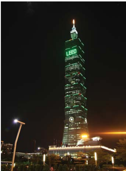
Taipei 101, Taiwan

With the efficient technology in place, the final step of the plan is to install controlling devices to monitor the use of energy. A Demand Control Ventilation System will be installed to measure CO2 concentrations and to determine how much fresh air is needed. Also the HVAC systems will be optimized by installing new building controls. Finally, tenants will have access to energy use data so they can benchmark themselves.