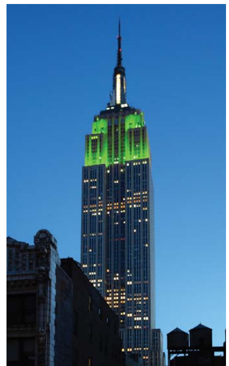
Empire State Building, New York