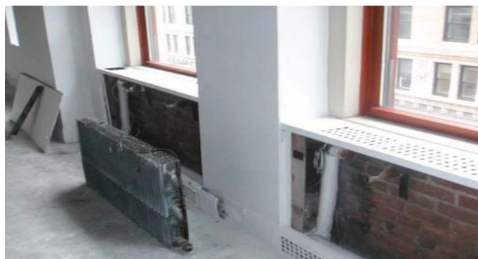
Installing insulated reflective barriers behind radiator units on the perimeter of the Empire State building

stand on the general philosophy of sustainability, we were selected to conduct a greening study of the Empire State Building. Jones Lang LaSalle and the Rocky Mountain Institute were selected as the project manager and design partner respectively.