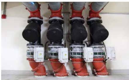
Taipei 101's Rain Harvesting System

the building scored very high on the Energy Star rating.