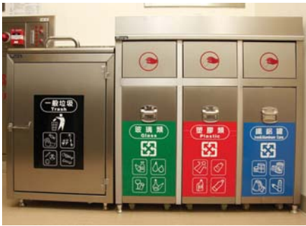
Taipei 101's Waste Recycling System

Lin: TAIPEI101 will invest almost US$2 million for improvements which will take roughly 20 months to implement. The project is estimated to save close to US$650,000 in energy costs each year after the transformation is complete.